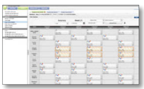
Therapy Support Suite - Clinic Scheduler